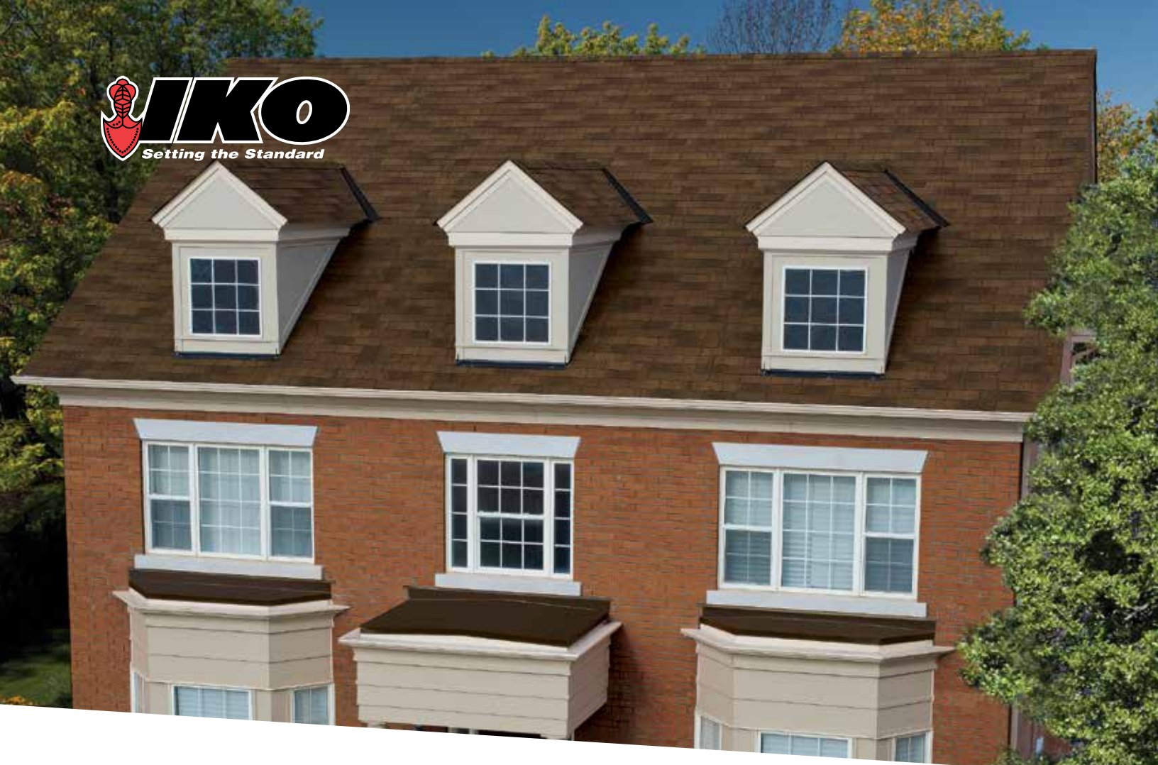
Color Featured: Dual Brown