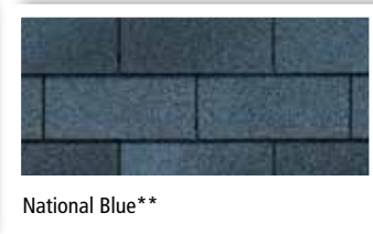
National Blue **