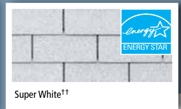
Super White ††